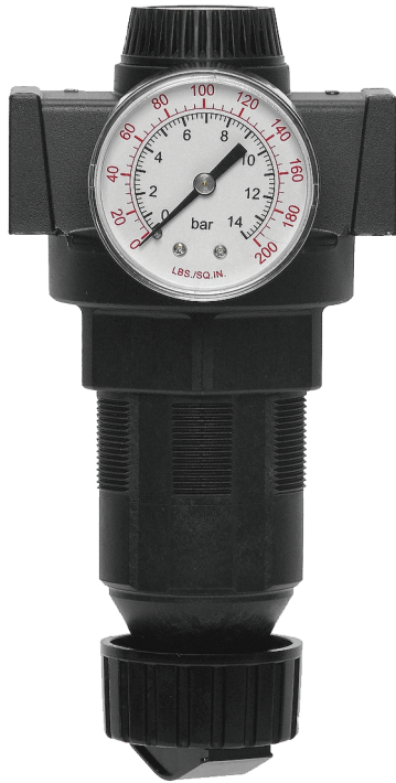
Model Shown: R100-6G