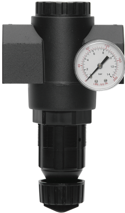
Model Shown: R180-10G