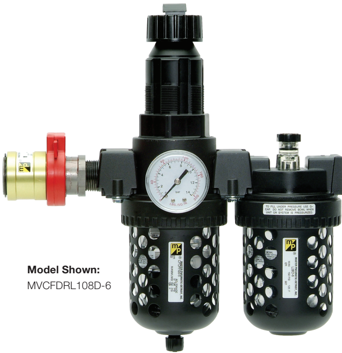
Model Shown: MVCFDRL108D-6