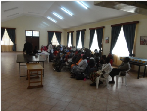
Left: Kids club members with their guardians during their meeting