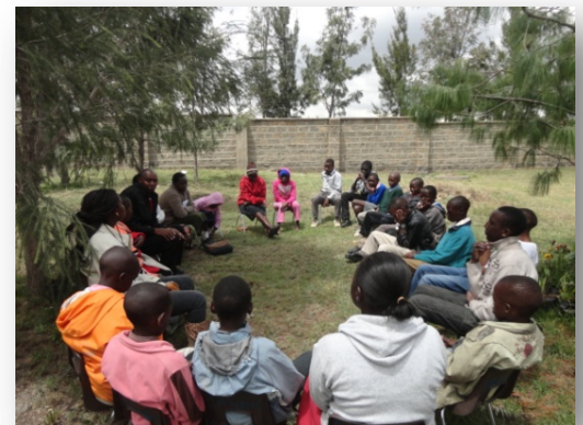
Right: Kids club teenagers in a discussion with Upendo Village and Kijabe staff