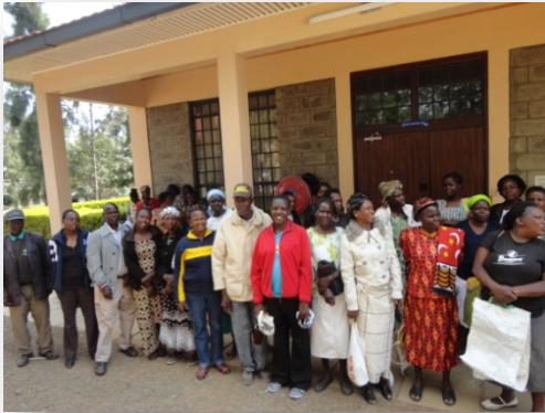
Members of the Karai support group

The support groups continue to empower our clients to live positively. During the period under review, we held four group therapy meetings. Two support groups were taught on HIV and AIDs while the other two were taught on T.B. signs and symptoms, treatment and prevention. During the period under review an average of 267 clients attended the group therapy meetings.