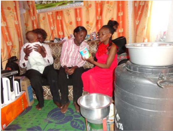
A PMTCT mother explaining to a Community health worker during A home visit how she uses the formula milk feeding guide

2012, “An act of Parliament to provide for appropriate marketing and distribution of breast milk substitutes; to provide for safe and adequate nutrition for infants through the promotion of breast feeding and proper use of breast substitutes, where necessary, and for connected purposes”. We had already stopped enrolling expectant mothers and babies in July 2014 when we started experiencing this problem of milk supply. We are now forced to wean all babies by September and October 2014. Since the stock we have can take us that far.