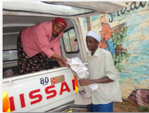
Left: Staff giving a blanket and clothing to a grandmother of 3 orphans. Right: a total orphan receiving clothes from staff