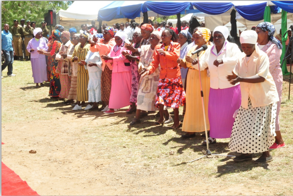
Grandmothers entertaining guests