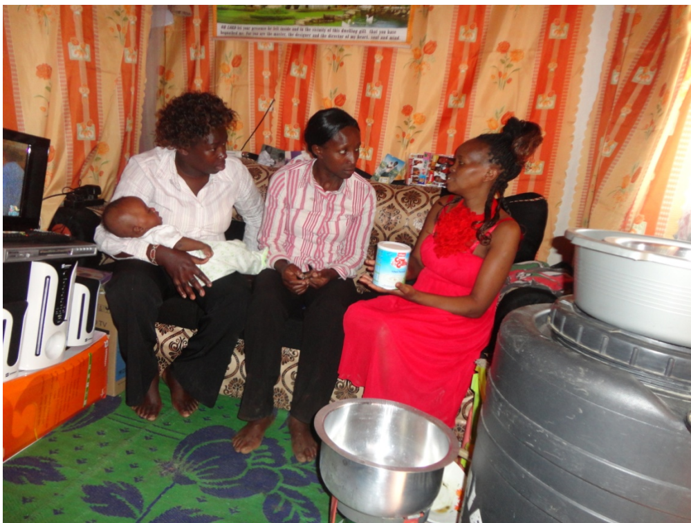
Community health workers with a PMTCT mother in red during homes visit

The project has enabled us create new partnerships. Health facilities and flower farms have been referring expectant mothers who opt for formula milk. The health facilities have also facilitated the follow up and collection of copies of early infant HIV diagnostic results.