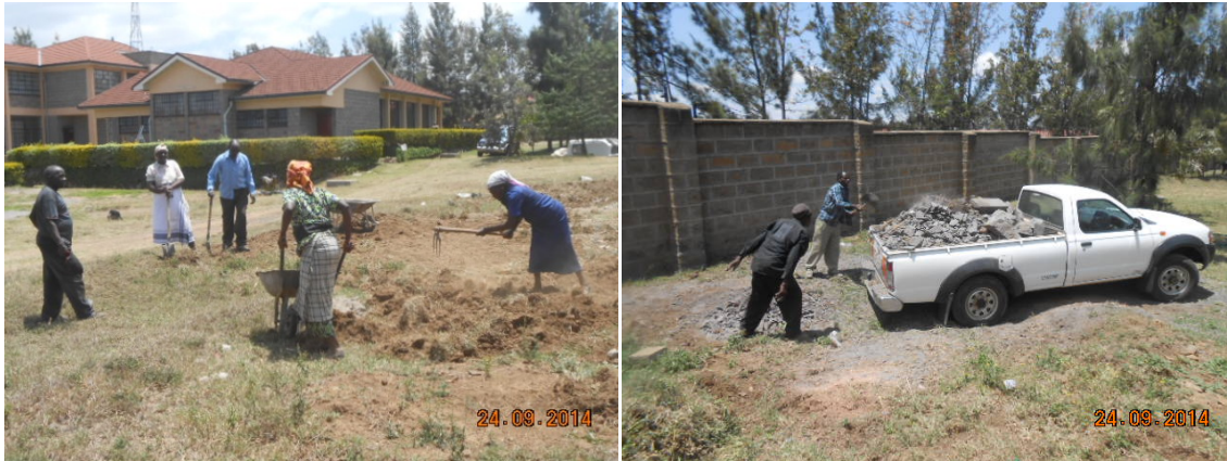
1 st and 2 nd photo: Clients clearing the ground

On the material day, the clients joined the Upendo Village staff to make the event colourful. We had two male clients who voluntarily shared their life stories to our guests and how Upendo Village has supported them. It was a very moving experience to our invited guests.