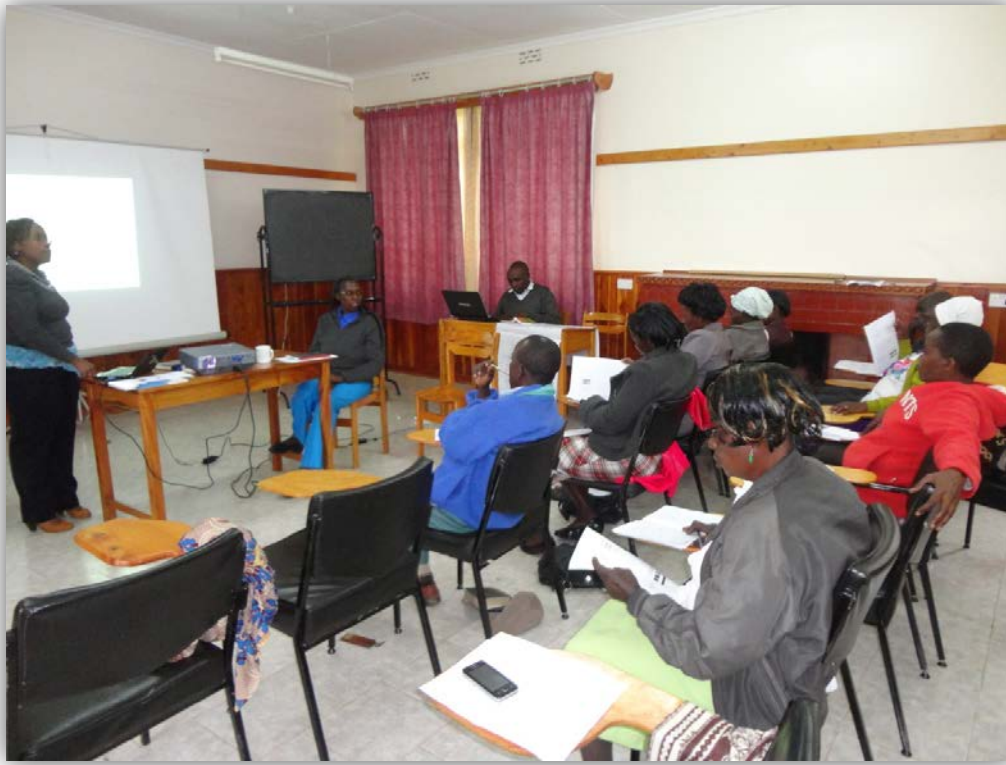
The Community health workers during a refresher training