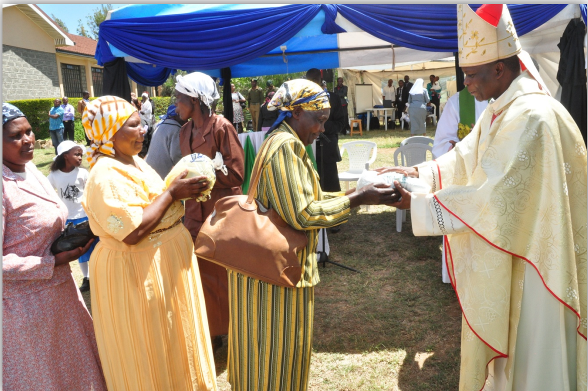
Grandmothers presenting gifts to the Bishop during mass