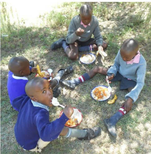
Figure 4: Pupils enjoying lunch during the academic day