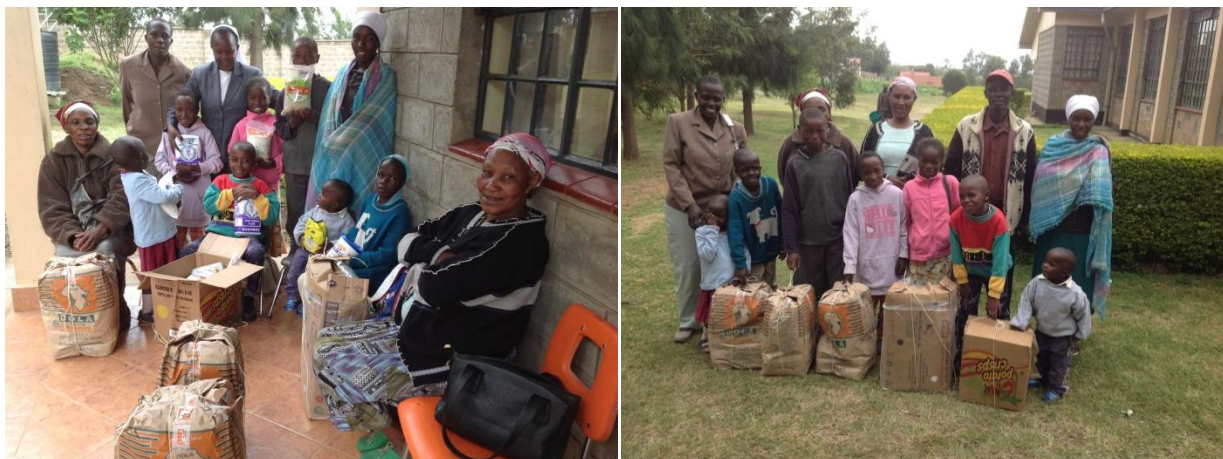
Needy families receive Easter gifts donated by a friend of Upendo Village