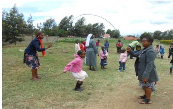
Left: Kids making drawings and right playing with the staff