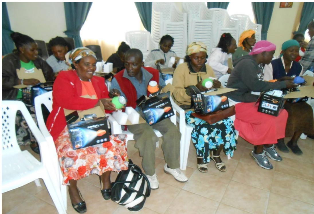
Figure 1: Parent/Guardian receiving solar lamps on behalf of students

Since 2012 there has been a concerted effort by ASN Upendo Village to ensure that all the sponsored children without access to electricity are supplied with solar lamps. On March 26 an additional 30 pupils/students were issued with solar lamps. The parents/guardians received the solar lamps on behalf of their sponsored kids because schools were in session. So far since the issuing of solar lamps began, 127 solar lamps have been issued to those sponsored kids with no access to electricity in their homes to provide them with a convenient mode of conducting their studies at night.