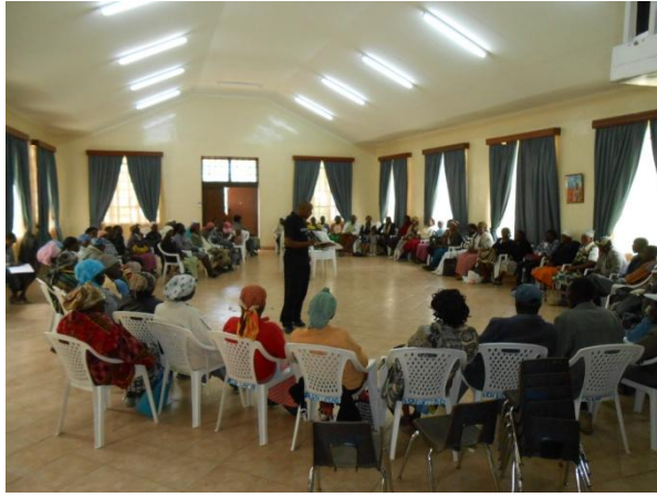
Guardians in a discussion during Kids Club Meeting

The younger children made drawings while others had a discussion on adherence. We had a facilitator living with HIV who talked to the teenagers on living with HIV, challenges and coping with the disease. Thereafter everyone was treated to a sumptuous hot meal. We had 102 children who turned up for the meeting and 74 guardians.