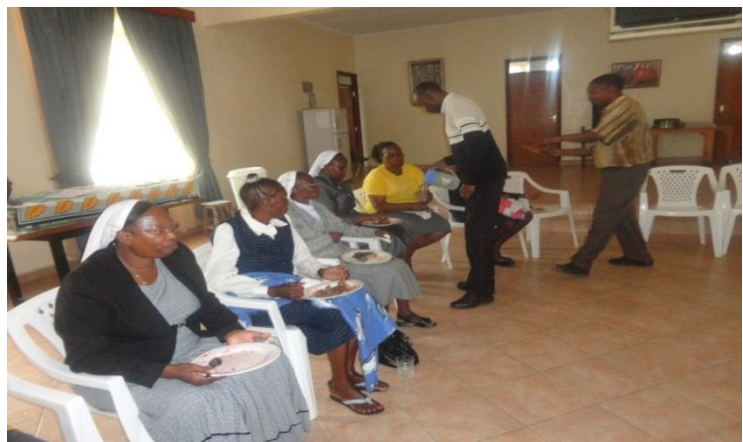
Male staff serving the ladies during the International Women's Day at ASN Upendo Village

The team from Upendo celebrated together and a member of staff gave a speech on the theme of the year and what Upendo has done to improve the lives of women in the community.