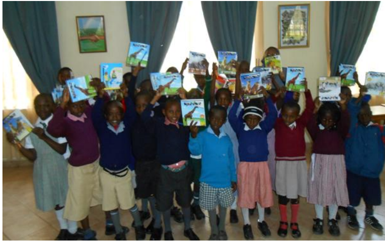
Figure 3: Some of the best performing pupils awarded