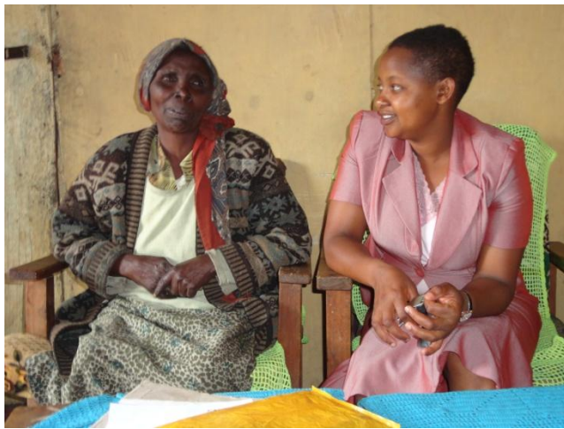
A Staff visiting a sick grandmother

During the period under review March and April, the grandmothers were taught on oral hygiene and Tuberculosis. On Tuberculosis they were taken through signs and symptoms, risk factors, treatment and prevention. Monthly contributions were made and two grandmas whose grand children were admitted in hospital were given money from their welfare kitty.