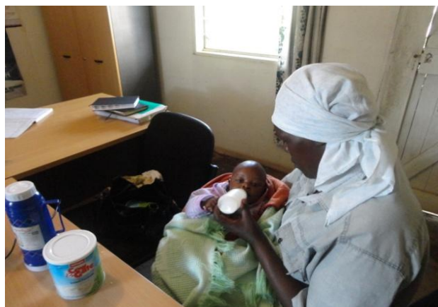
Right: Staff counseling a teenage PMTCT mother. Left: A mother giving formula milk to her baby