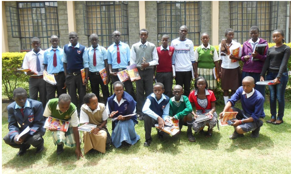
Figure 6: Some of the best performing students/pupils awarded

Generally the academic performance of most students was good even though none managed to score a Mean Grade of a straight A across all forms. Equally no student scored below a Mean Grade of D- across all forms as indicated in Table 1.0. The Form one performance was comparatively better to that of other classes. However, the performance of the form 4 candidates and form 2 students is a bit wanting.