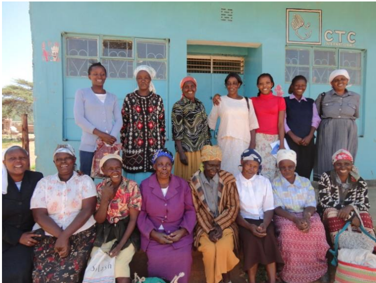
Maai Mahiu Grandmas support group with Upendo Village staff.

We have held meetings with the grandmothers in the last two months. The Maai Mahiu group continues with the merry go round contributions and so far 10 have benefited with local chicken. In the month of February they decide to start a Kitchen garden, each received 2 old sacks to plant collard and spinach in. We hope to visit them to see the progress. The Town group decided to bank their contributions until December this year when they will decide what they will do with their shares.