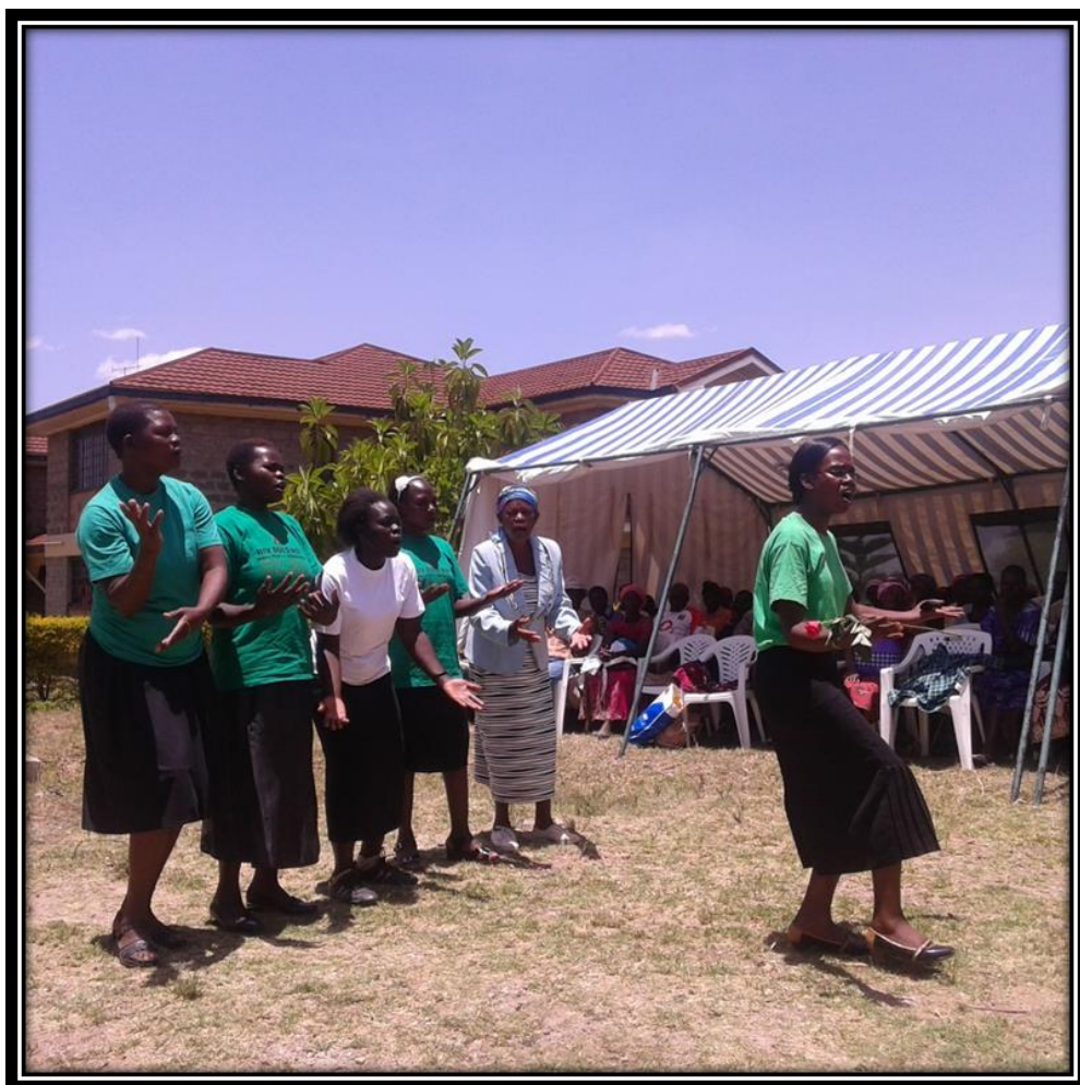
Members of Mirera support group presenting a song.