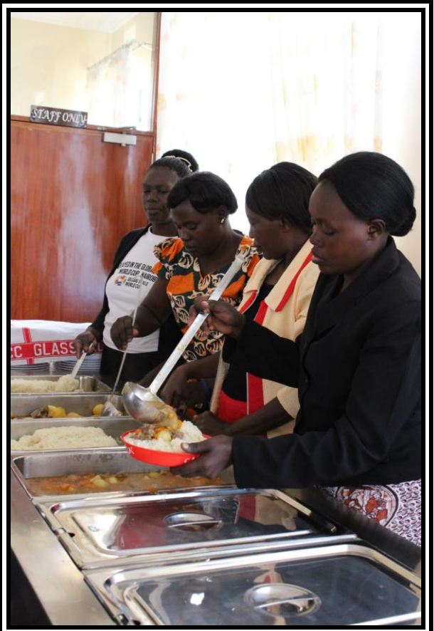
Left: Kids lining up to be served with nutritious meals. Right: Parents/ guardians serving their kids with lunch at the new kitchen and dining building.