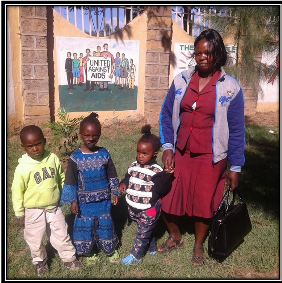
Kids club members with one of the guardians posing for a group photo.