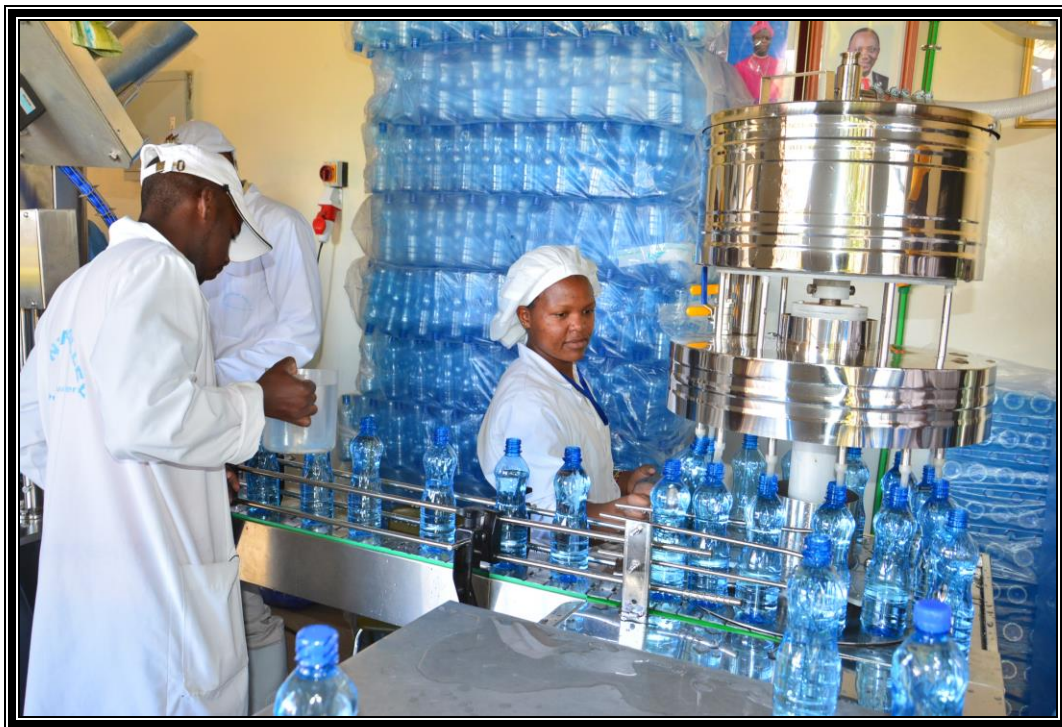
Water attendants filling bottles of water using the newly installed semi-automatic water processing machine.

Through the introduction of a 1500 bottles per hour semi-automatic water processing/ bottling plant, water packaging (filling, capping, sealing and labelling) was increased by 200% therefore packaging between 2500 to 3000 litres of purified and filtered water in 2 hours from the current 500 litres in 8 hours.