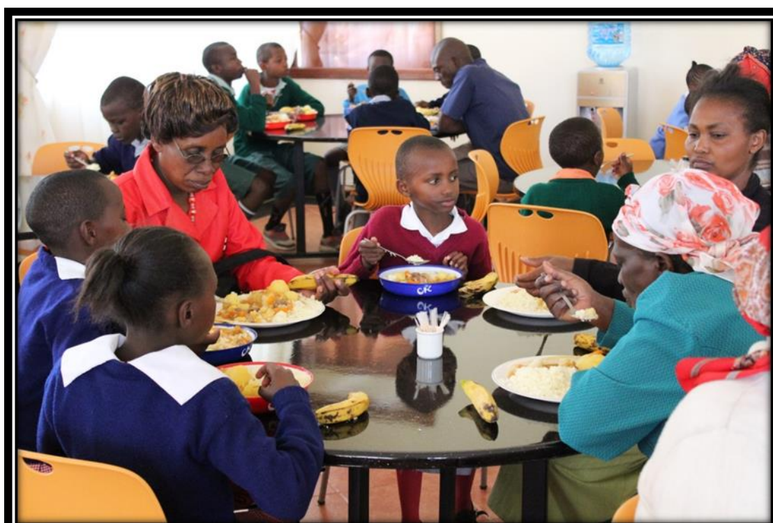
Pupils and parents/guardians enjoying their lunch during academic day I.