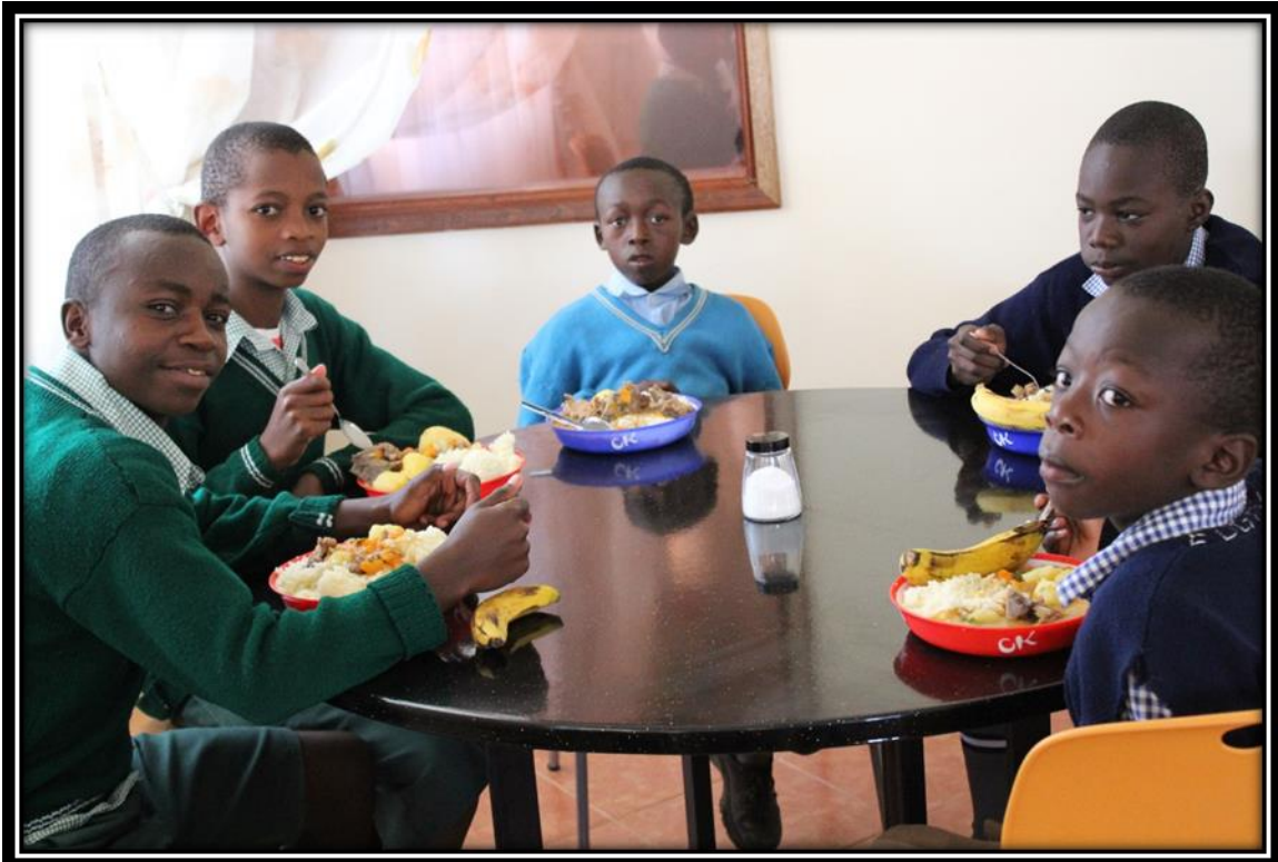
Pupils enjoying nutritious lunch at the new constructed kitchen and dining building.