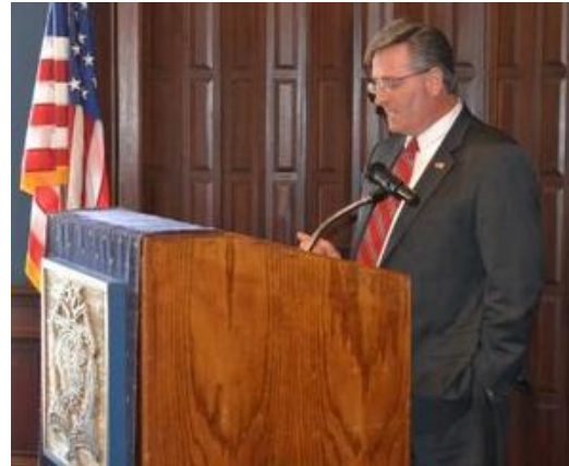
Paul Davis , Candidate for Mayor of the City of Riverside