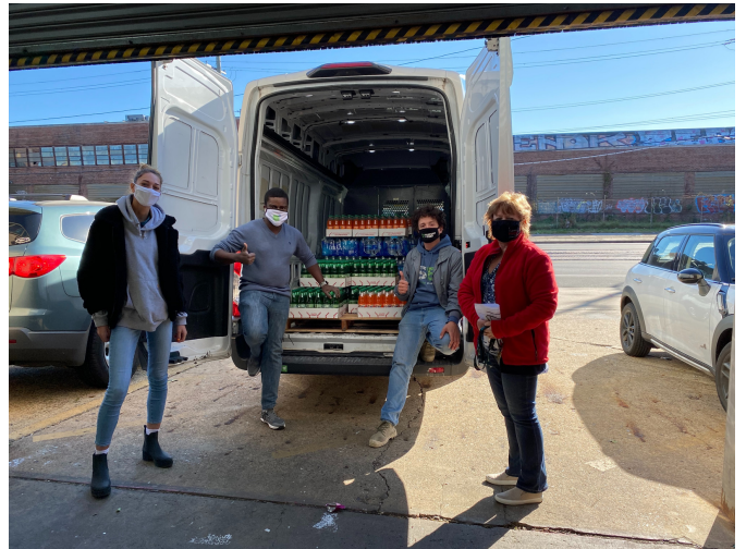
Election Day Partnership - WPCC partnered with Coca-Cola, Business For America and Sharing Excess to deliver 50 cases of soft-drinks to polling locations for the General Election.

Since the program's inception, we've negotiated partnerships that have created over $500,000.00 in tangible investments in West Philadelphia.