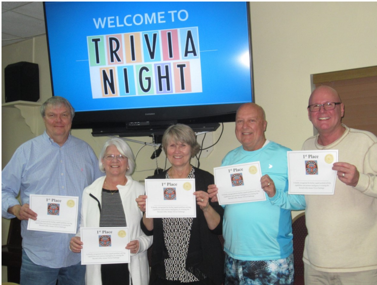
The Mudhens, winners of the Second Annual Trivia Night