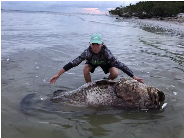
300 lb. Dead grouper found off the Florida west coast

Harmful algae blooms along Florida's coasts are sending people to emergency rooms and killing marine wildlife by the scores.