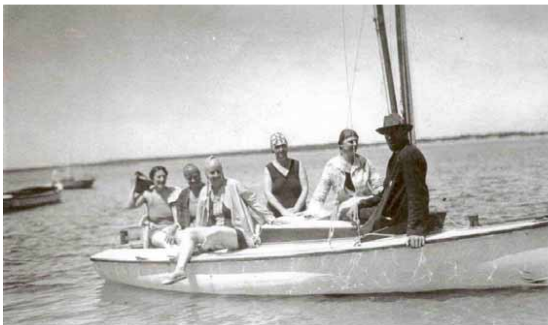
Early 1930s

SGYC is renowned for its friendly atmosphere and although we are a small regional club you will find we have a big heart so pack up that beautiful craft sitting in the garage and head for Inverloch for Australia day weekend.