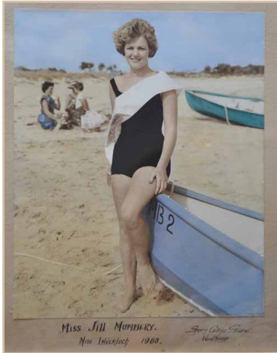
Miss Inverloch was the first Bathing Beauty contest in Victoria circa 1920.