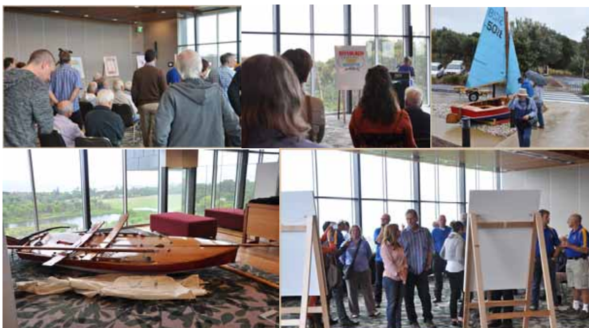
Boat displays and poster launch at RACV Resort Inverloch