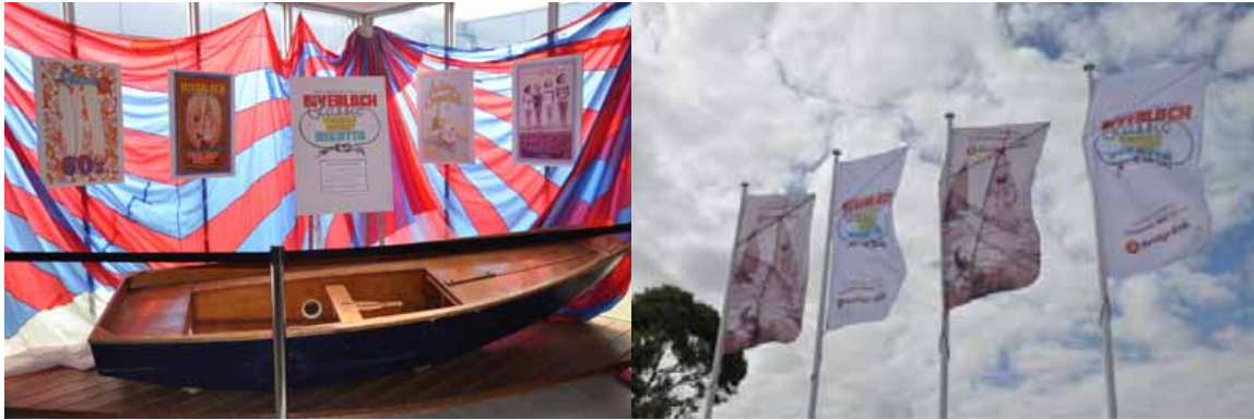
Display in Community Centre and regatta flags raised in Inverloch