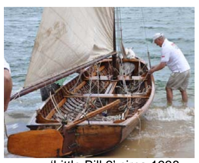
'Little Bill 2' circa 1938