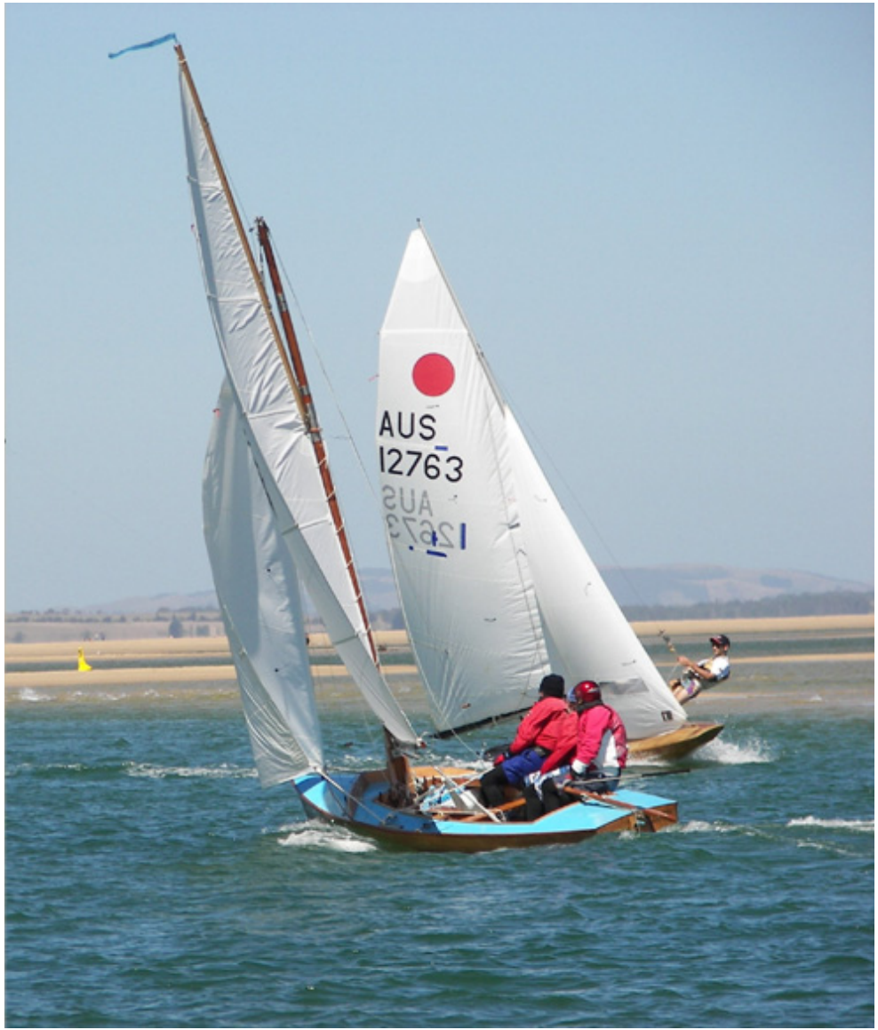
The Classic photo of the Classic Regatta - 12 Sq Metre and Fireball