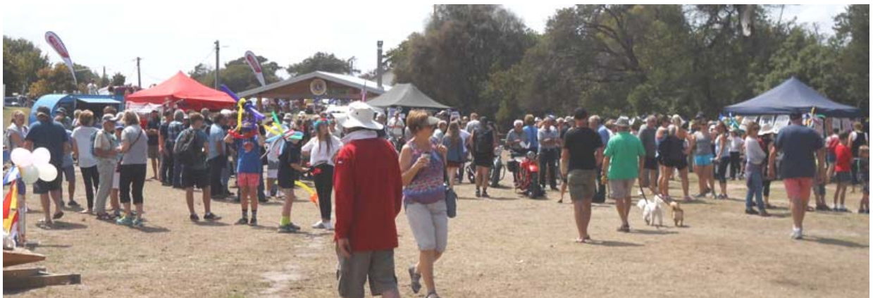
THE INDIAN MOTORCYCLE CLUB OF AUSTRALIA CAME ALONG TO CELEBRATE BOTH AUSTRALIA DAY IN 'THE GLADE' AND BURT MUNRO RACING IN INVERLOCH IN THE LATE 1920S