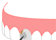
Cleaning and Preparing procedure