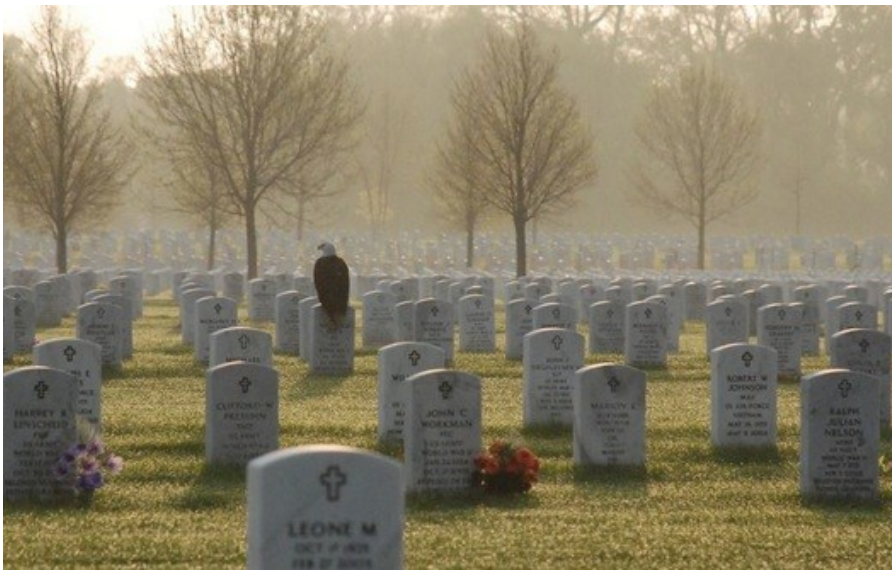
Fort Snelling Cemetery Bloomington, Minnesota, 2011.