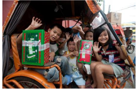
Shoeboxes being delivered by cart in the Philippines!