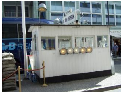
Check Point Charlie