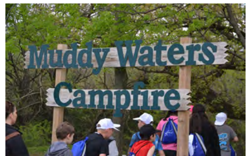
Boy Scout Camp at Brown's Park