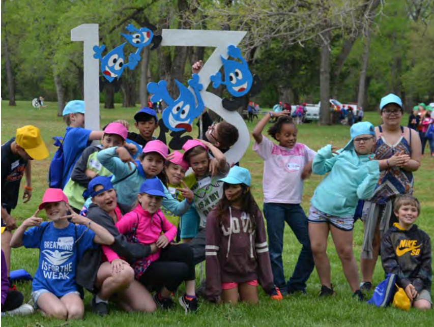
13 Years of Fun

The 2019 Waterfest was held at Brown's Park in Abilene. Close to 300 4th graders from schools around the county participated in a variety of water quality and water conservation activities. Volunteers prepared a hot lunch for all participants and volunteers and Milford Lake Nature Center presented a Birds of Prey program.