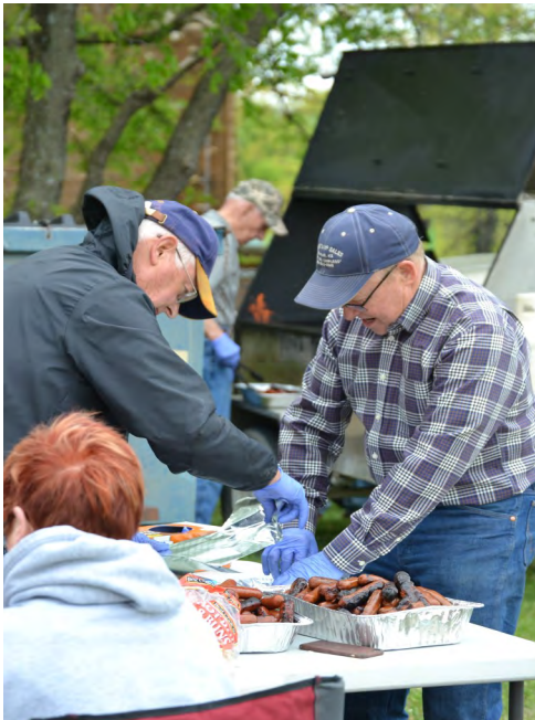
Volunteers prepare BBQ lunch