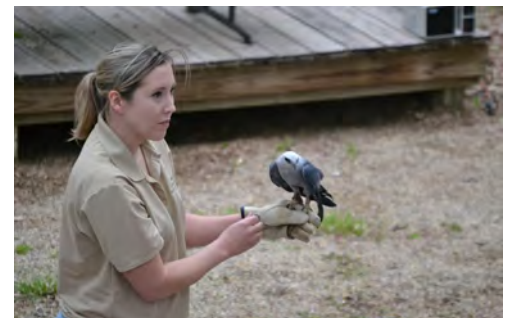
Milford Nature Center Birds of Prey