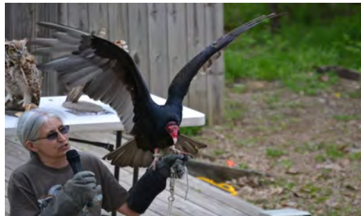
Mr. Lurch the turkey buzzard came to visit