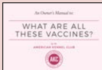
WHAT ARE ALL THESE VACCINES?