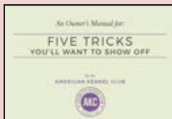
FIVE TRICKS YOU'LL WANT TO SHOW OFF