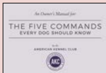
THE FIVE COMMANDS EVERY DOG SHOULD KNOW

We hope this information was valuable to you in helping your puppy live a long, healthy, happy life. Below, find additional books in our Owner's Manual series designed to strengthen the bond between you and your furry family member.