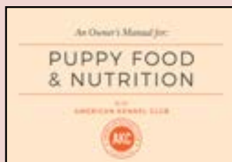
PUPPY FOOD & NUTRITION