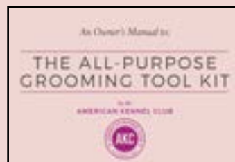
THE ALL-PURPOSE GROOMING TOOL KIT