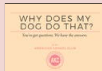
WHY DOES MY DOG DO THAT?