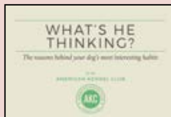
WHAT'S HE THINKING?