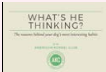
WHAT'S HE THINKING?