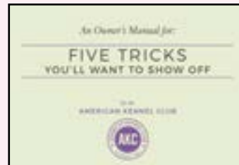
FIVE TRICKS YOU'LL WANT TO SHOW OFF