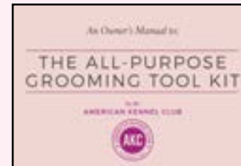
THE ALL-PURPOSE GROOMING TOOL KIT