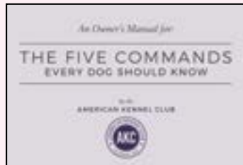
THE FIVE COMMANDS EVERY DOG SHOULD KNOW

We hope this information was valuable to you in helping your puppy live a long, healthy, happy life. Below, find additional books in our Owner's Manual series designed to strengthen the bond between you and your furry family member.