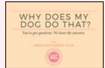
WHY DOES MY DOG DO THAT?