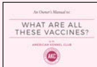
WHAT ARE ALL THESE VACCINES?