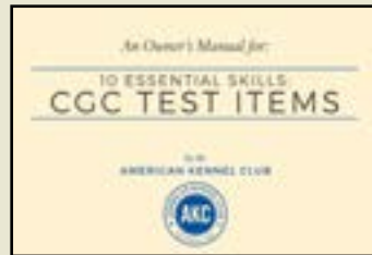
10 ESSENTIAL SKILLS: CGC TEST ITEMS