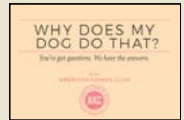
WHY DOES MY DOG DO THAT?