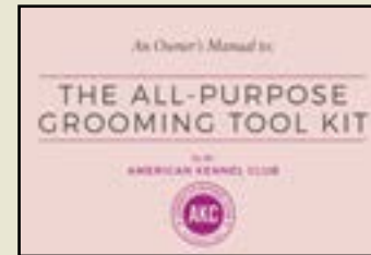
THE ALL-PURPOSE GROOMING TOOL KIT