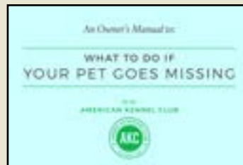
WHAT TO DO IF YOUR PET GOES MISSING