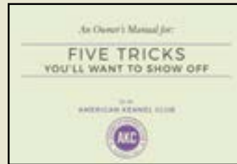
FIVE TRICKS YOU'LL WANT TO SHOW OFF