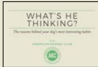
WHAT'S HE THINKING?