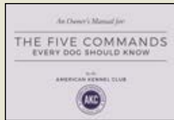
THE FIVE COMMANDS EVERY DOG SHOULD KNOW

We hope this information was valuable to you in helping your puppy live a long, healthy, happy life. Below, find additional books in our Owner's Manual series designed to strengthen the bond between you and your furry family member.