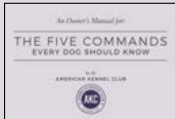
THE FIVE COMMANDS EVERY DOG SHOULD KNOW

We hope this information was valuable to you in helping your puppy live a long, healthy, happy life. Below, find additional books in our Owner's Manual series designed to strengthen the bond between you and your furry family member.