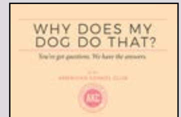
WHY DOES MY DOG DO THAT?