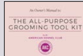
THE ALL-PURPOSE GROOMING TOOL KIT