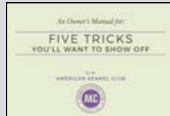
FIVE TRICKS YOU'LL WANT TO SHOW OFF