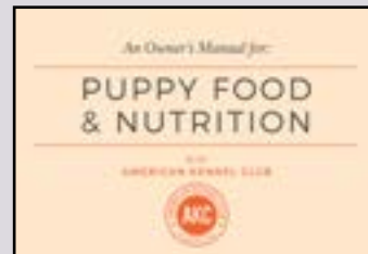
PUPPY FOOD & NUTRITION