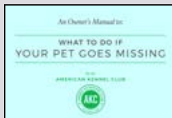
WHAT TO DO IF YOUR PET GOES MISSING