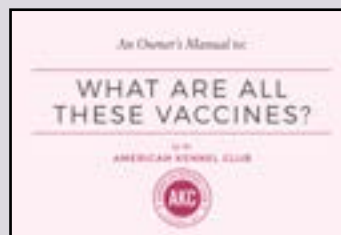
WHAT ARE ALL THESE VACCINES?