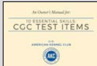
10 ESSENTIAL SKILLS: CGC TEST ITEMS