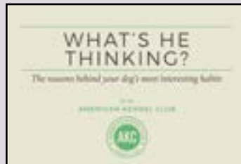
WHAT'S HE THINKING?