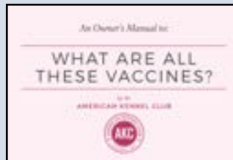
WHAT ARE ALL THESE VACCINES?