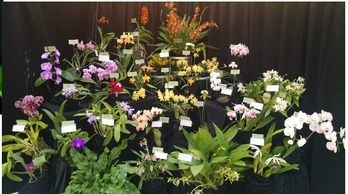
Above is our exhibit at the 2015 New Orleans Orchid Show.