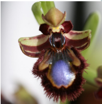
Ophrys Speculum Glen Ladnier