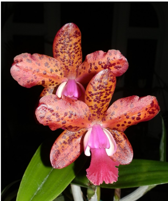
Left is C. Korat Spots submitted by Pat Dickey

The program for the September meeting will be "Miniature Orchids". Most people think of large cattleya flowers when they think orchids, but there are many miniatures which are just as beautiful, with flowers that can be very intricate and colorful. These wonderful small beauties are perfect, especially for the grower who has limited growing space.