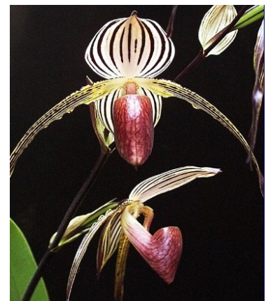
Paph. Lady Isabel