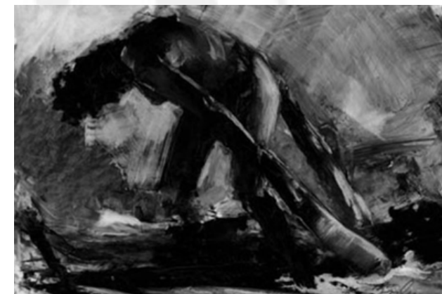
Jim Boden 1+1<2#7, oil on mylar. Winner 2001, 1st Biennale.

The International Drawing Biennale, organized by the Polish Art Foundation Inc, celebrates its 20th anniversary in 2019. This artistic event allows contemporary artists from around the world to reflect on the important role of drawing in art. We invite you to join us in this global dialogue and send your work.