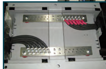
Top view of rack installation

QUALITY SYSTEM CERTIFIED TO ISO 9001 ISO/TS 16949 ISO 14001