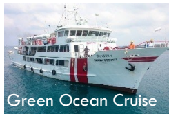
Green Ocean Cruise