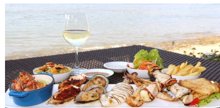
The Andamans offer you the most exotic seafood

The food of the Andamans is simply delectable. You will be amazed at the variety of seafood that you get to sample here. You will discover lip-smacking simple fare at humble shacks as well as the most exotic gourmet's delights prepared especially for you by master chefs and served for you by candlelight on the beach. Take your pick from continental or from North Indian and South Indian, Bengali and Gujarati, vegetarian and non-vegetarian cuisines. The diversity is simply mind blowing.