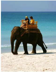
Elephant ride on Havelock Island

Glorious landscapes, picturesque islands and historic edifices, the Andamans appeal in a great variety of ways. You could rent a holiday cottage in a luxury resort or perhaps opt a budget eco-friendly resort tucked away in a corner of the city of