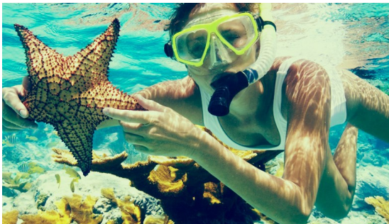
Go snorkeling in the Andaman Sea