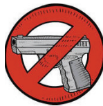
Concealed Carry Permit