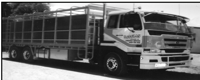
Douglas Livestock Services Stanhope Stud Stock & Commercial Cattle Carriers Hay Cartage Mobile: 0429 956 906 - AH Ph/Fax: (03) 5857 2525