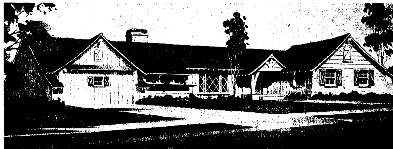
ON VALLEY SITE —Excellent example of rustic farm architecture is the above home called the Encino Farm-house, built by E. Steinkamp, Inc. One of its features

The large lots have been planned to permit maximum landscaping and are described as having graceful slopes. A combination of 18 floor plans and exterior designs is offered for selection.