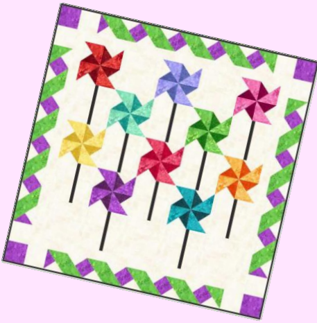
In The Breeze 39" x 39" 2-day Workshop & Trunk Show