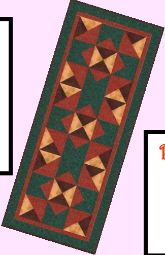
Radiant Runner 21" x 60" 1-day Class & Trunk Show