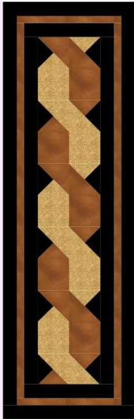
Southwest Splendor Runner 23" x 56" 1-day Class & Trunk Show