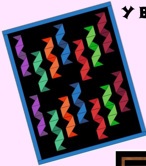
Confetti 55" x 68" 2-day Workshop & Trunk Show