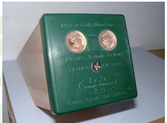
The unique patented top of the Green Termite Bait makes it very easy to check at a glance.

Only one termite bait system in Australia is ant-resistant . It is the Green Termite Bait System™. There is simply no way for ants to enter a correctly installed Green Termite Bait™, because they are a sealed solid timber unit.