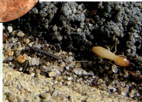
This Soldier Termite was sighted under pavers.

(Note: Larger photos are available online at www.greenpest.com.au )