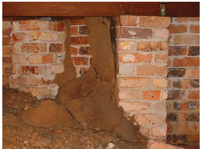
Termite nest on a brick wall under a house.

No. Unless the work is specifically for termites, normal pest control for other insects will not help.