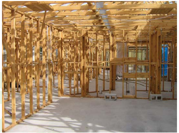
This is how a colony of termites sees your home - only as a meal