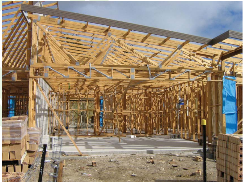
This roof is supported by the timber frame, not by the outside brickwork, which is only cladding.