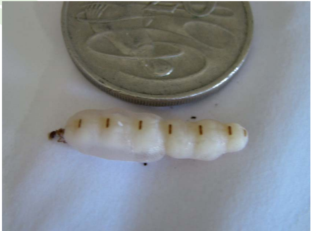
This egg-laying machine produces 1,000+ eggs per day and some nests have more than one queen.

You need termites to make a didgeridoo? They hollow out the non-living wood in the centre of a tree branch. They will also travel through the centre of a pole or a stump on your home.