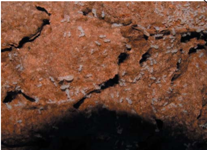
Worker Termite (4.5mm long). The little ones are juveniles, found in the heart of the nest.