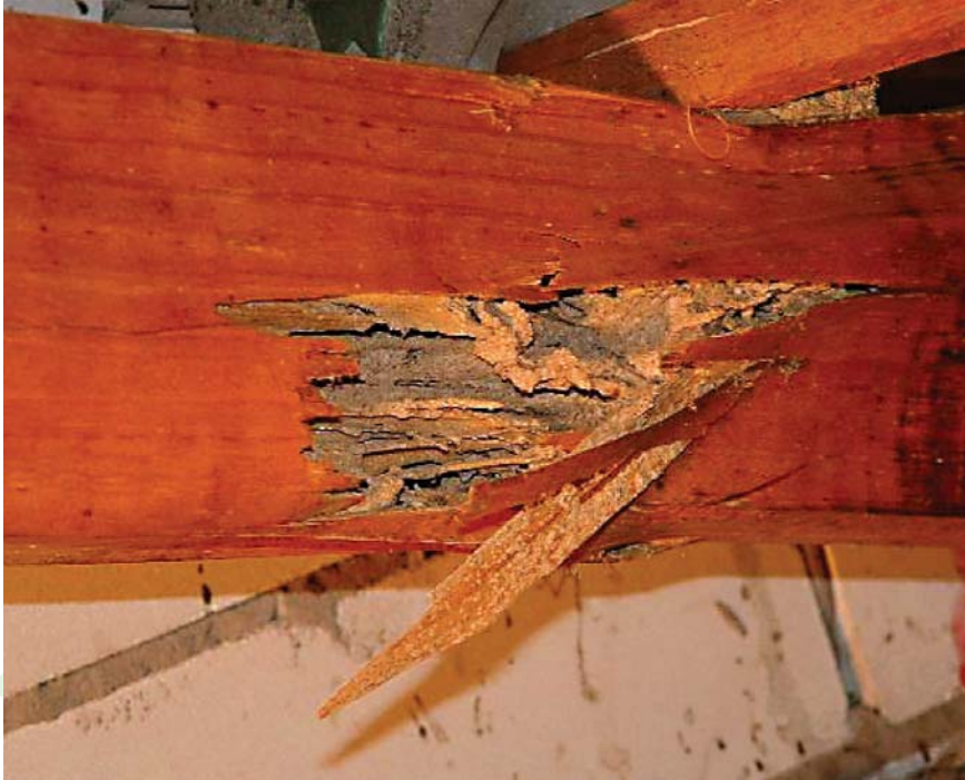
Termite damaged wood in the roof of a house.

A 3-4 bedroom house on a slab will average 20-30 Green Termite Baits™. More baits mean more strikes and consequently more termiticide is being transferred back to the nest. The termite nest will be destroyed sooner. More baits also means that you have more chance of detecting the termites earlier and gives you a greater coverage around your home.