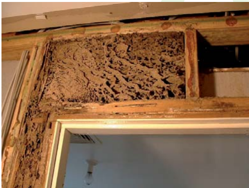
Termite nest above a bathroom door.

Lower risk homes are homes that are totally constructed from metal frame ; totally double brick and metal roof trusses; homes on metal poles completely clear of the ground or besser block homes where the besser blocks are completely filled with concrete on several courses. Even still, most of these homes have many timber components that are expensive to replace if damaged by termites.