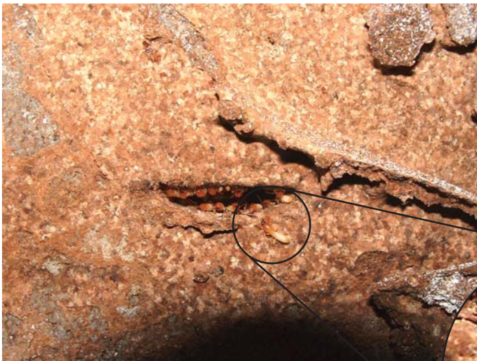
Soldier Termite Coptotermus spp. (5.8mm long).