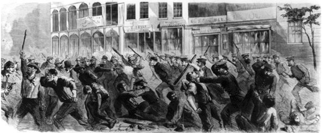
RUDE OF BROADWAY, ABOVE THE LAFABIR HOUSE, WHERE THE POLICE PUSHED THE RIOTERS, UNDER COMMAND OF INSPECTOR CAFFERTY.

crowd became unruly, and the worried mayor of Dayton called out the fire department and extra policemen.