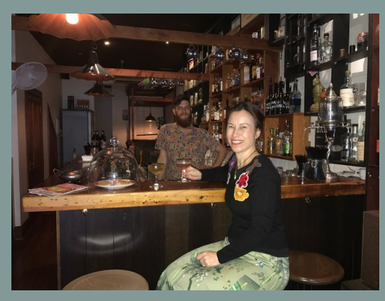
Bake Bar Cafe 112 McEvoy St, Alexandria.

Arguably some of the best bread in Sydney! Worth the 20 minute walk! Their multigrain sourdough is amazing. They will slice it for you.