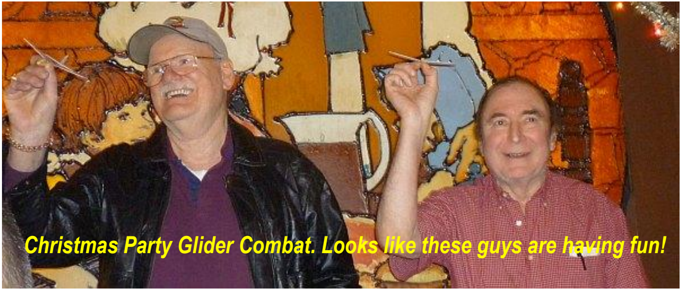
Christmas Party Glider Combat. Looks like these guys are having fun!