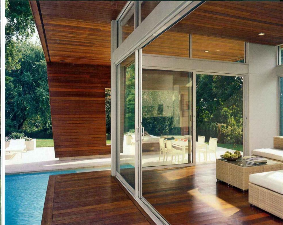
OPPOSITE ABOVE: "It's almost like a piece of sculpture that's engaging the landscape," says Hariri. "The design took on a more important role because of its proximity to the house. You walk onto the back lawn, and that's what you see." OPPOSITE: Opening the sliding doors heightens the effect of living inside and outside at the same time. Flos pendant lights. Dedon-fiber sofa and tables from Janus et Cie. ABOVE: The wood gives you the feeling, she says, of being "on a boat deck." BELOW: The pavilion at dusk.