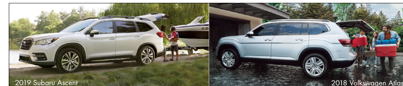
2019 Subaru Ascent

Marine Sanitation & Supply | www.MarineSan.com | Call 800 624 9111 to find a dealer near you