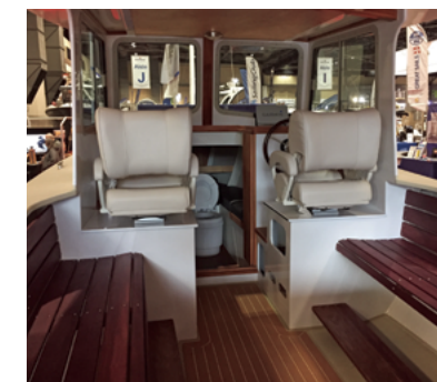
Top: Even on a cloudy day, Solar Sal has enough energy to maintain 3 knots. More speed, of course, draws from the batteries and means less range. Below: Inside the Devlin-built Solar Sal at the 2019 Seattle Boat show.

hull with a large roof area with panels. For what we're doing, the hull form is very important to success for 100 percent solar. The hull needs to be a long, thin, hyper-efficient full displacement one to work. It is easy to add solar panels to any boat to increase efficiency and reduce the need for a generator. BRJ Solutions in Seattle and Revision Marine in Port Townsend do excellent work designing systems like this for existing boats. NWY