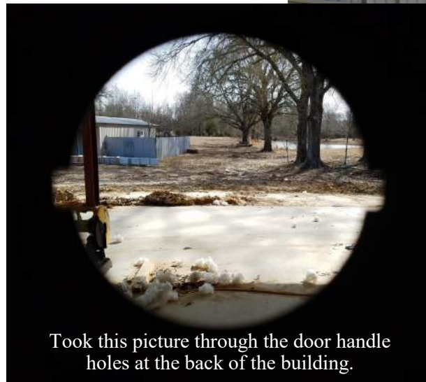
Took this picture through the door handle holes at the back of the building.

For us Lakesiders: As we work on our ministries, we need to keep these areas in our minds and ensure that we incorporate them in everything we do.