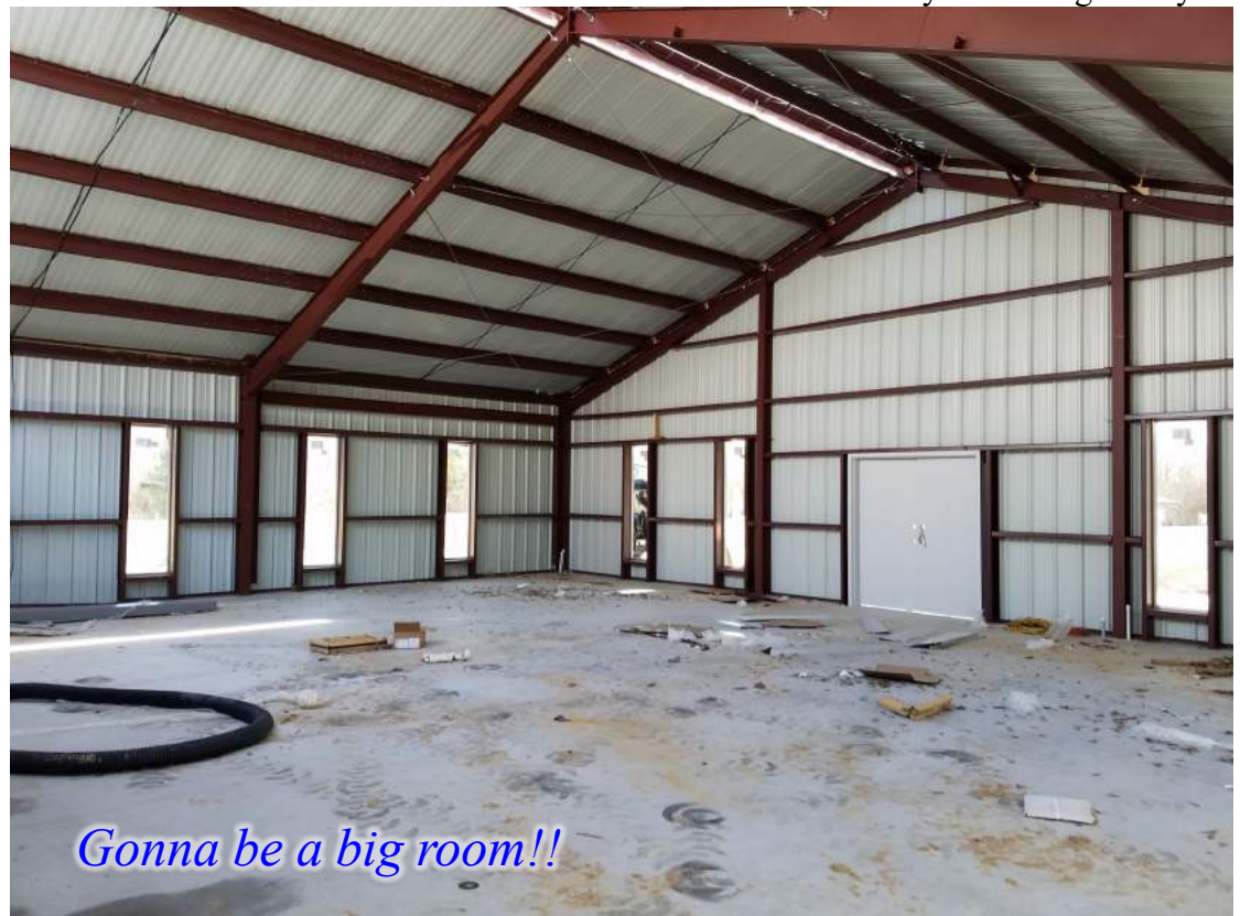
Gonna be a big room!!