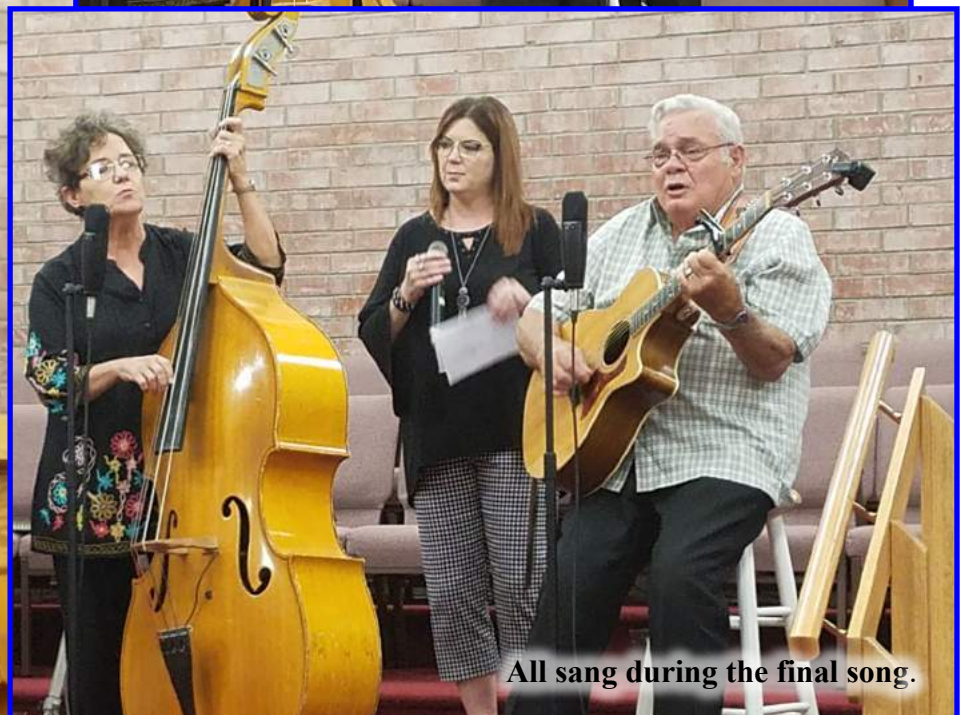
All sang during the final song.