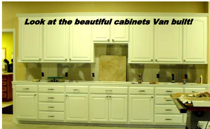
Look at the beautiful cabinets Van built!

Work continues on the new Fellowship Hall with the installation of the heat/air systems, drop down ceilings, lighting, paint on the walls, cabinets and electrical components all in! Next week will see installation of the counter tops and back splashes, as well as the flooring. Looks great! Our workers are really hard at it. Check out the schedule for providing lunches to the workers. They deserve it!