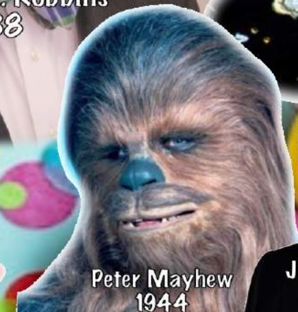
Peter Mayhew 1944