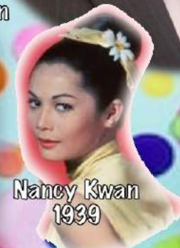
Nancy Kwan 1939