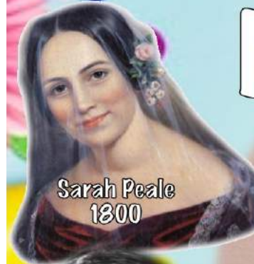
Sarah Peale 1800