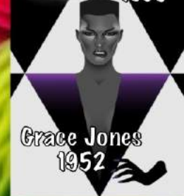
Grace Jones 1952