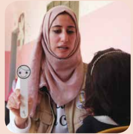
An ophthalmologist tests one of the camps' child's vision

would benefit from the support of the BASR. Once identified, the multi-disciplinary BASR Outreach Team visit children and their families to assess what help can be given. This is where ABCD steps in through our Individual Needs Programme offering assistive devices such as wheelchairs and orthotics, home modifications, home rehabilitation sessions, provide hearing aids and spectacles and much more. The list is endless but the results are heartening, changing the lives of these