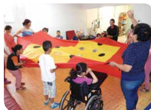
Day care centre children taking part in a connection session

"Many families have more than one child with disabilities, one of these has three disabled children. The youngest one, a 4-year-old boy with severe developmental delay and visual impairment who was initially very withdrawn and unresponsive, is making wonderful progress. He loves to play and has acquired a few words despite the very poor original prognosis he was originally given."