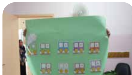
The Count Down Train, a carriage removed every session so the children knew how many were left

At BASR, I ran open groups for in-patients and their carers (generally mothers) on the pediatric ward. The mothers reported it gave their children time out to enjoy themselves, making them more co-operative even after a morning of therapy and clinics. The Speech and Language Therapy department referred four young boys for group music therapy. Using blown instruments such as kazoos encouraged the children to develop their vocal skills with others. On Fridays I ran a music hour for the educational group, also open