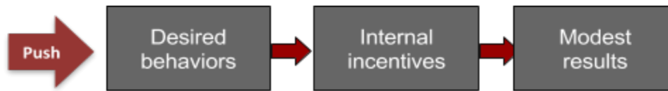
Figure 1. The Push Model