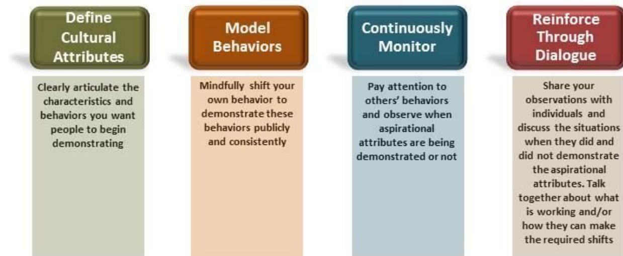
Figure 3. The Manager's Dialogue for Change

Develop people. Leaders should be ready to model desired changes, as they will have an important role in reinforcing the new behaviors. Spend time with people re-programming the basic assumptions that guide successful behaviors. This is where the traditional push approach comes into play. The model detailed in Figure 3 may help.