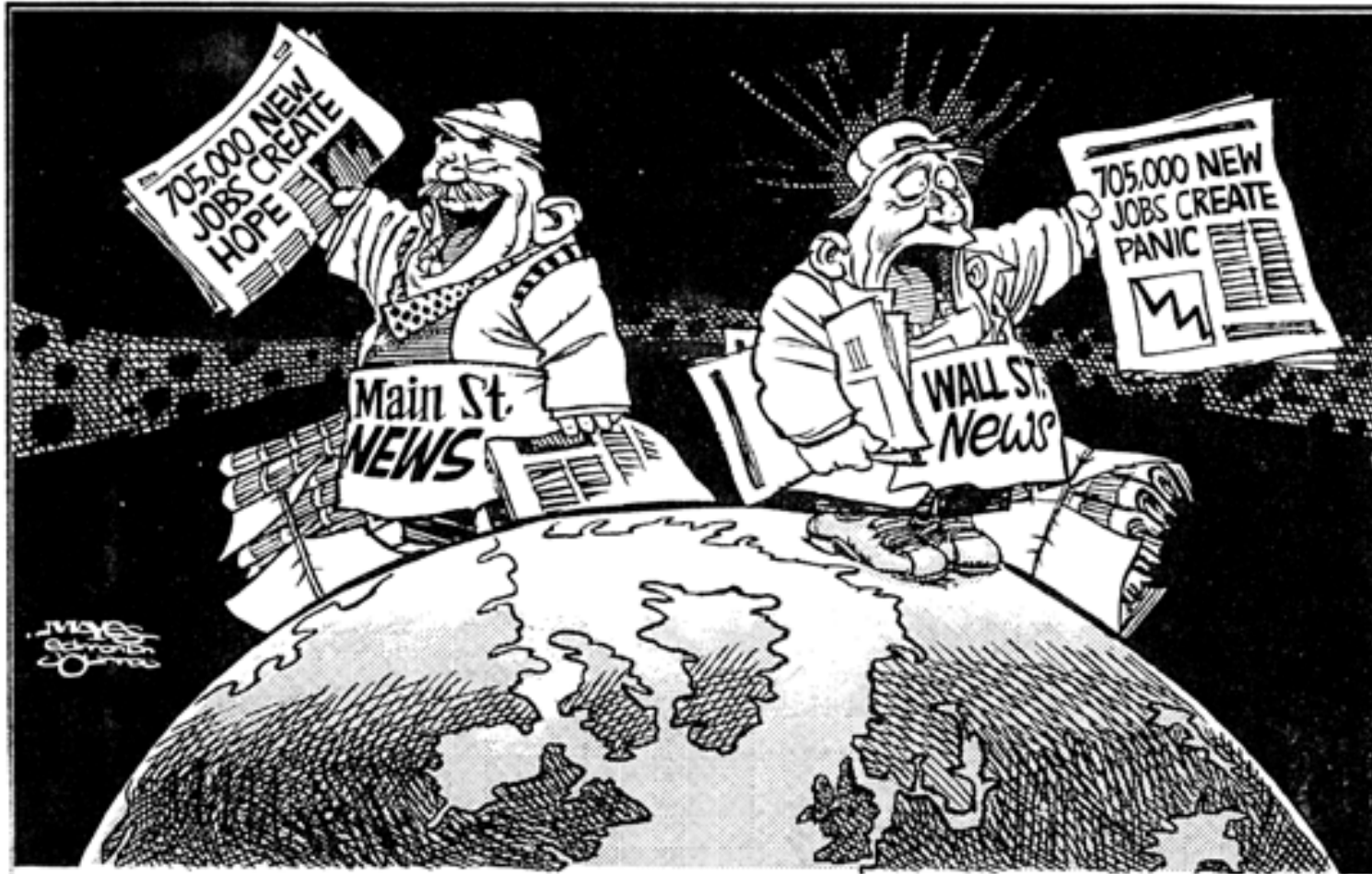
SAME PLANET, DIFFERENT WORLDS.