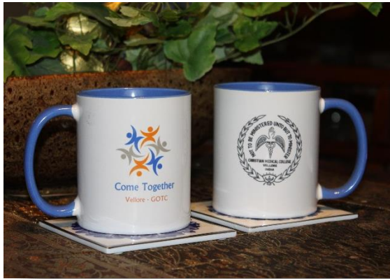
CUSTOMIZED GOTC MUGS

For the Medical Alumni Healthcare Assistance Fund