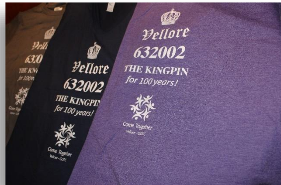
VELLORE 'KINGPIN' T SHIRTS