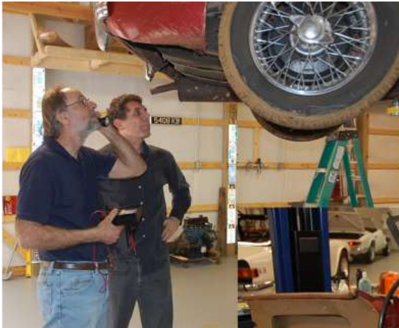
Searching for the mysteries of Lord Lucas