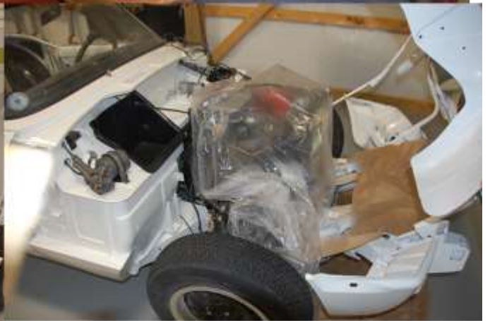
Not that it saw any action on this day, but the Spitfire is seeing some progress. Just not enough to brag about. It should show up at an event soon!